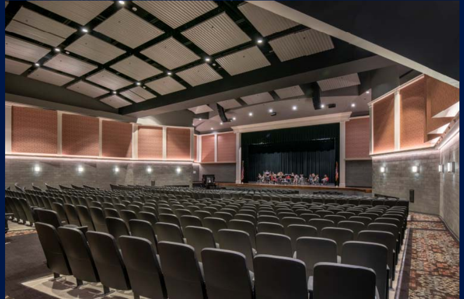
Example of a new Auditorium