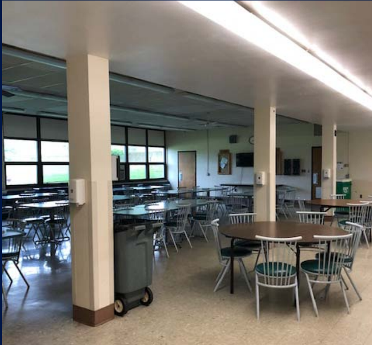
Wickliffe High School Cafeteria