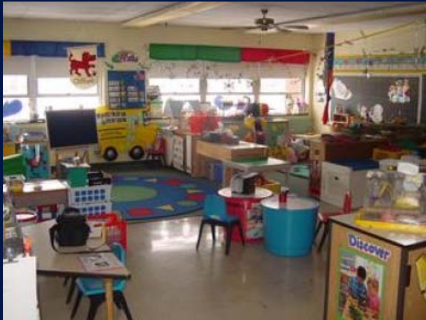
Wickliffe Elementary Classroom