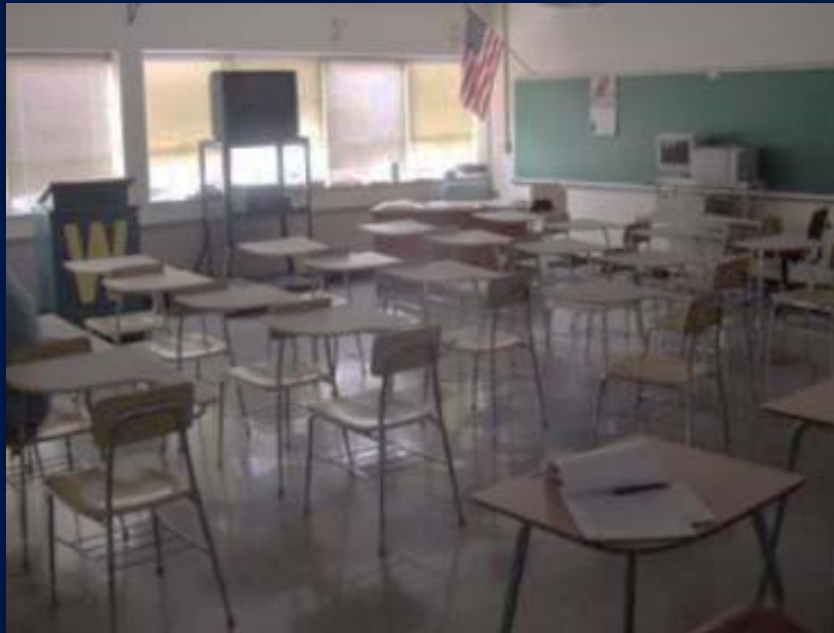
Wickliffe High School Classroom