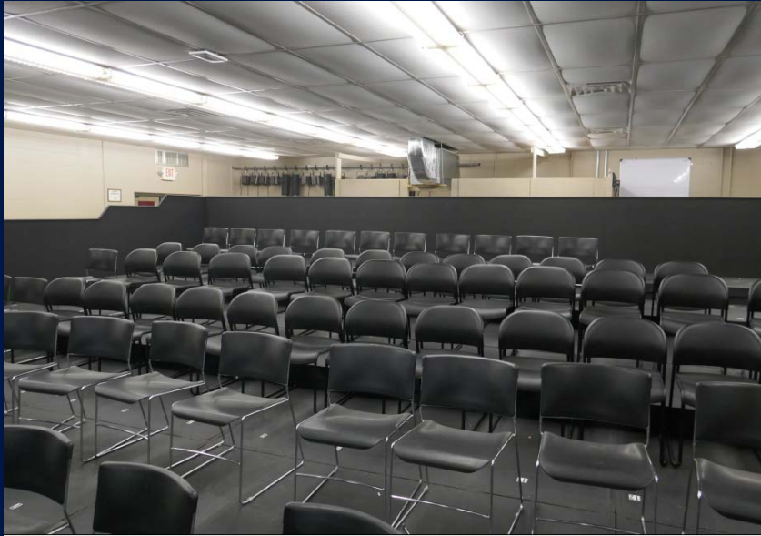
Wickliffe High School Theatre