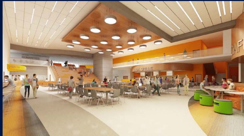
Example of a new High School Cafeteria