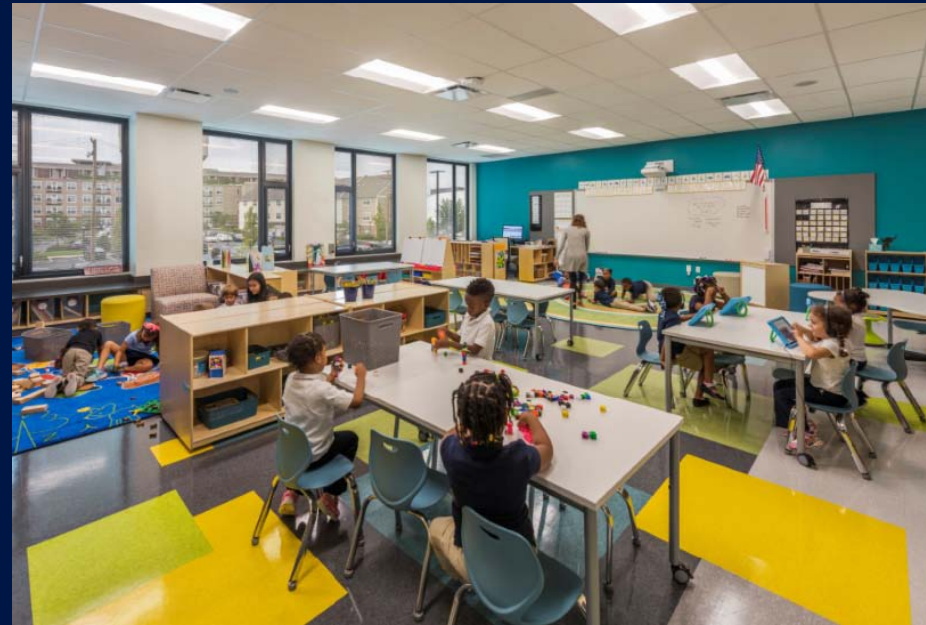
Example of a New Elementary Classroom