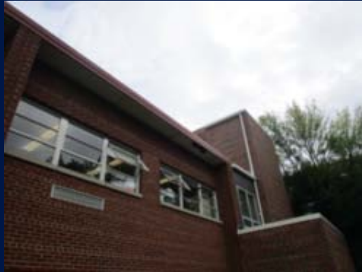
Wickliffe Elementary School - Windows Extensively Caulked