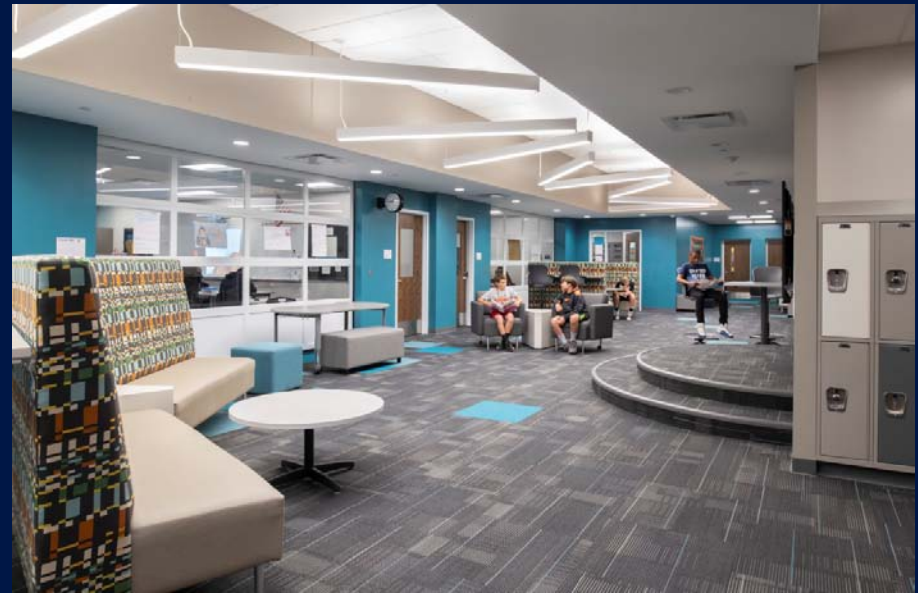
Example of an Extended Learning Area